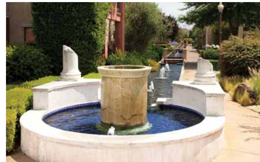
(Bottom left) The soothing scent of lavender drifts through the gardens, enhancing the peaceful experience of an evening stroll. (Above) The hotel boasts beautifully landscaped gardens and cozy cobblestone courtyards, accented by a Tuscan-style waterway lining the walking path and a signature Italian waterfall and statue at the entrance of Villagio Inn & Spa.